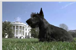
Barney , Scottish Terrier George W. Bush 2001-2008