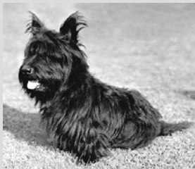
Fala , Scottish Terrier FDR 1933-1945