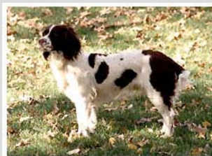
Millie , Springer Spaniel George Bush 1989-1993